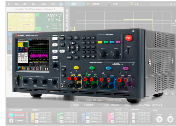
Figure 1. The Keysight N6705 DC power analyzer with 14585A software.

Each DC power module output is fully isolated and floating from ground and from each other.