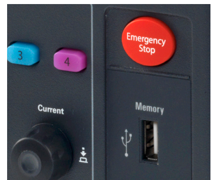
Figure 12. The emergency stop button shuts down all outputs immediately.