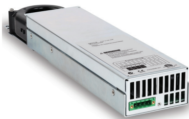
Figure 14. The basic series.

The Keysight N6750 series of high-performance, autoranging DC power modules provide low noise, high accuracy, and output voltage changes that are up to 10 to 50 times faster than other power supplies. Additionally, autoranging output capabilities enable one power supply to do the job of several traditional power supplies.