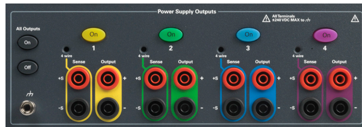
Figure 13. Option RBP recessed binding post

The Keysight N6705 has a universal input that operates from 100-240 VAC, 50/60/400 Hz. There are no switches to set or fuses to change when switching from one voltage standard to another. The AC input employs power factor correction.