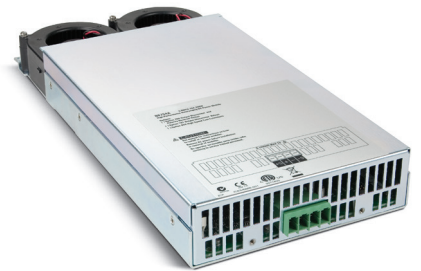
Figure 15. The N6750 high-performance series and N6760 precision series DC power modules that are \geq 300 W each occupy two modules slots within the mainframe. All other modules occupy one module slot.

For details on these products and how they can be used for specific applications visit www.keysight.com/find/N6783A-BAT www.keysight.com/find/N6783A-MFG and download the N6783A-BAT Data Sheet , 5990-8662EN and the N6783A-MFG Data Sheet , 5990-8643EN.