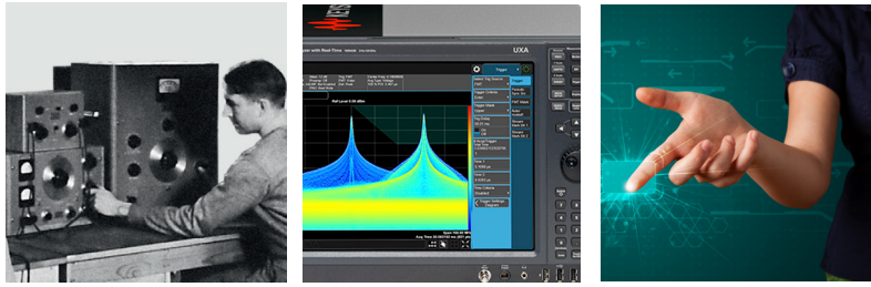
From Hewlett-Packard to Agilent to Keysight

Our unique combination of hardware, software, support, and people can help you reach your next breakthrough. We are unlocking the future of technology.