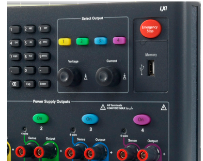
Figure 11. The N6705's front panel USB port.

Note: Output current is limited on some modules when option 760 Output Disconnect/Polarity Reversal Relays is installed. See the “Available options” tables on page 21 for more information about maximum current limitations with option 760.